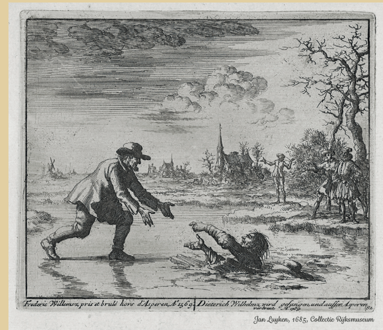
Dirk Willemsz, pris et brulé hors d'Asperen, le 1569. Dieterich Willemsz wird gefangen, und auffen Asperen verbrant. Jan Luyken, 1685.

Dirk was thereafter held until he was condemned by a group of seven judges, who, quoting Willems' "persisting obstinately in his opinion", ordered that he be burned at the stake on the 16th of May, 1569, as well as that all his property be confiscated "for the benefit of his royal majesty". Dirk was executed in Asperen, and with a strong eastward wind blowing that day, the fire was driven away from the condemned's upper body, thus prolonging his torturous death. It was reported that the wind carried his screams all the way to nearby Leerdam, where he was heard to have exclaimed things such as "O Lord; my God", etc., over seventy times. The bailiff on horseback nearby was so saddened by Willems' suffering that he said to the executioner, "Dispatch the man with a quick death." Though it isn't known if the executioner obeyed this request, it is known that Willems eventually died there, "with great steadfastness", and "having commended his soul into the hands of God".